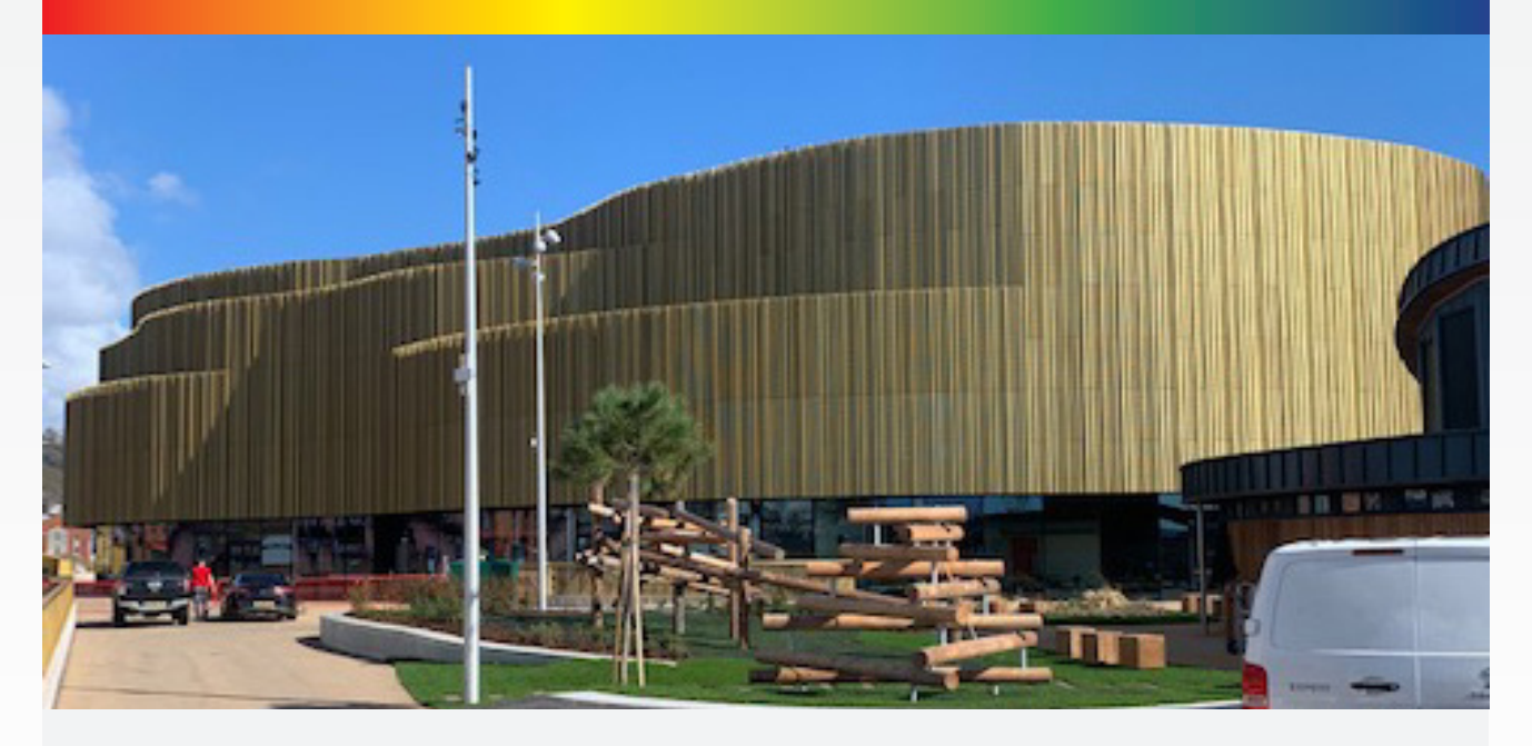
Case Study - Commercial Swansea Arena